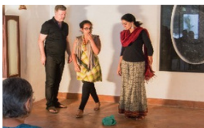
Second Step: "action"