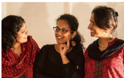
Third Step: "reintegration"