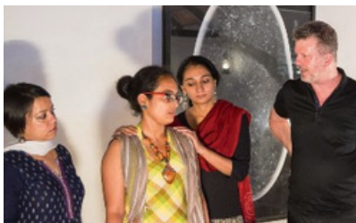
First Step: "warming up"